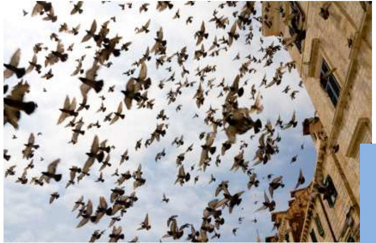
PIGEON CAGE TRAP

The Pigeon cage trap makes it easy to control the Pigeon population on any property.